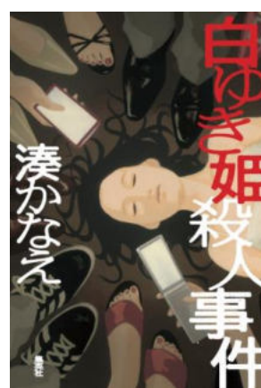
SNOW WHITE MURDER CASE

Kanae Minato was born in Hiroshima in '73. She won the Shosetsu Suiri new writers competition in '07 for a short story, which was made into her debut novel, CONFESSIONS, and awarded the Bookseller Award in '09. She writes many novels and stories, including the Edgar-nominated PENANCE and other award-winning masterpieces. Her SNOW WHITE MURDER CASE has sold more than a million copies at Shueisha. She is one of the most popular novelists in Japan today.